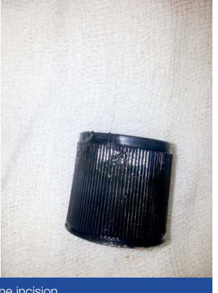
[Table/Fig-1]: Foreign body seen through uterine incision [Table/Fig-2]: Removed foreign body.